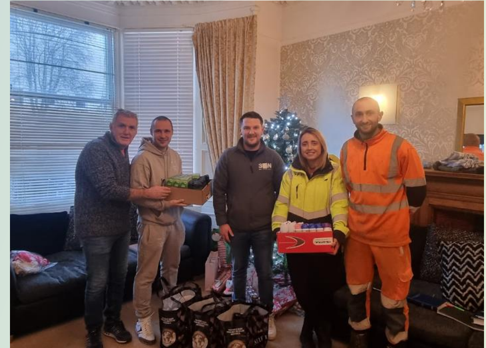
Engaging with Homeless & Addiction Services