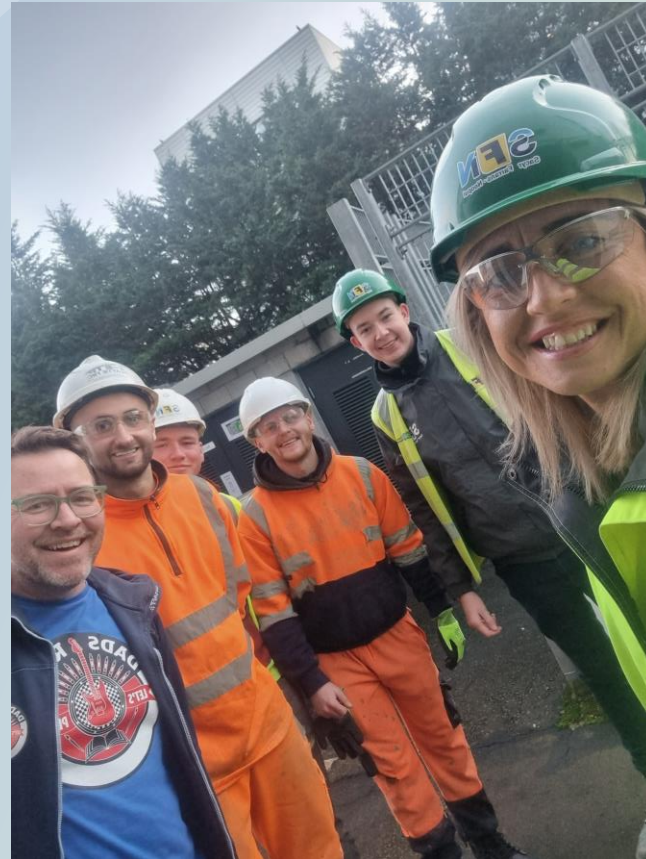
School Engagements in communities