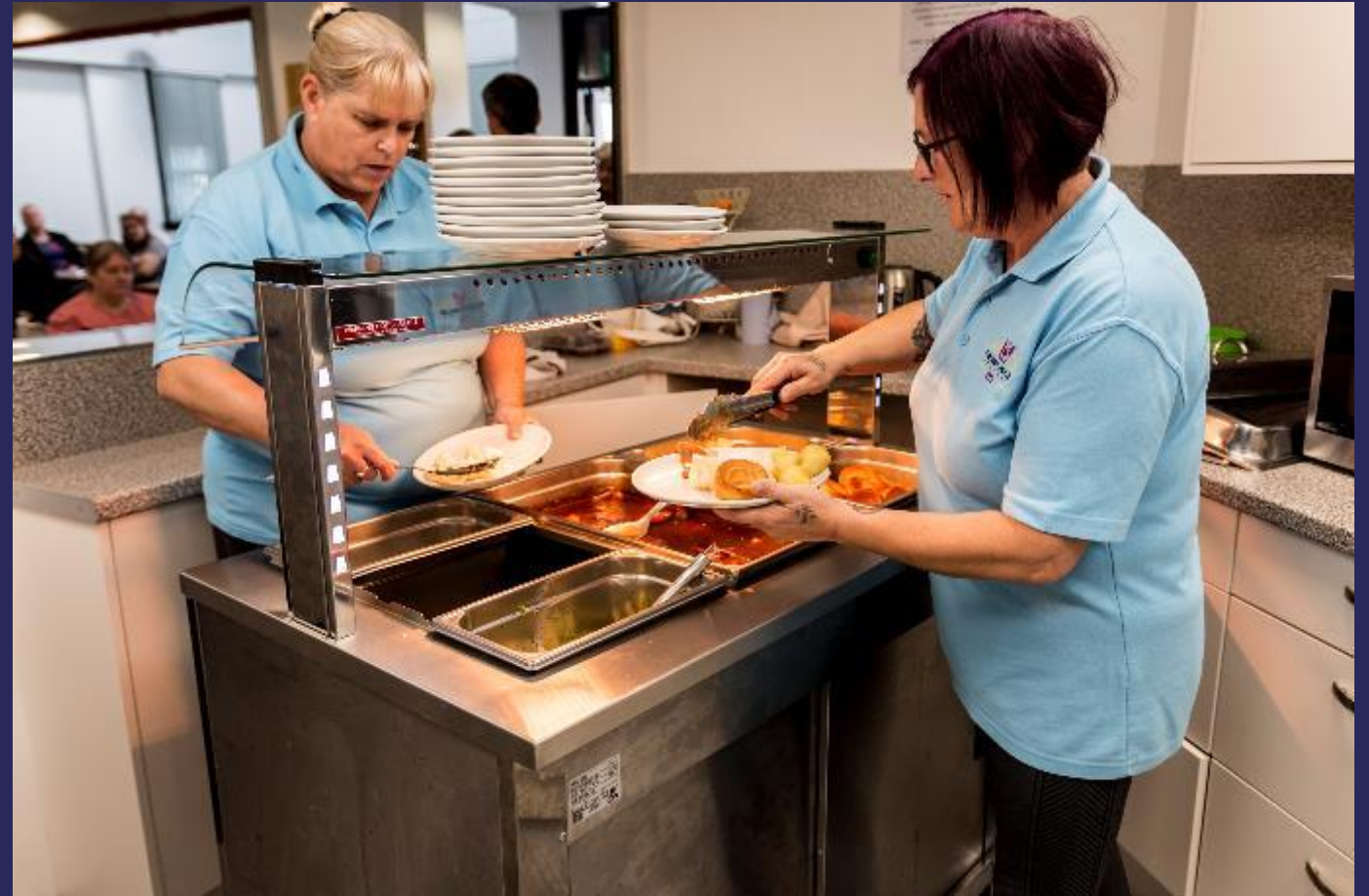
Ferguslie seniors volunteers