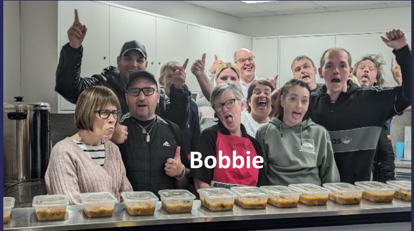
Wednesday Drop in group