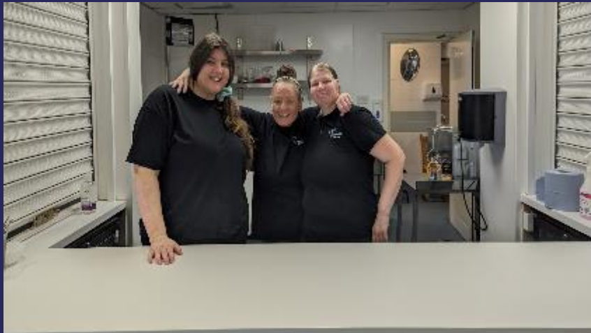
T in the tanny volunteers